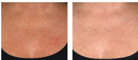
Before and after 1 treatment