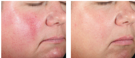
Before and after 3 treatments