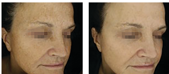
Before and after 2 treatments